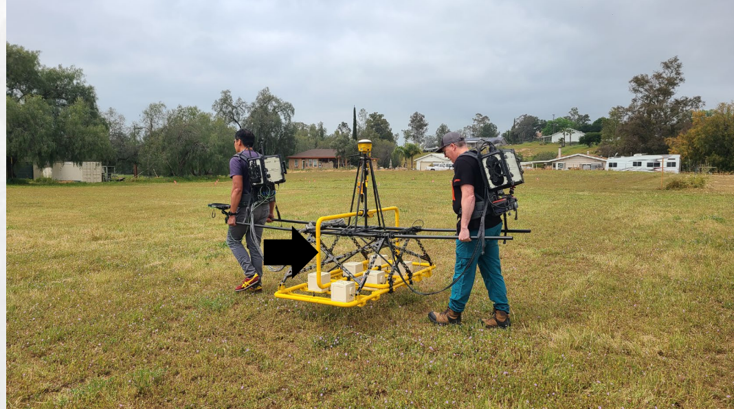
Person Portable Mode