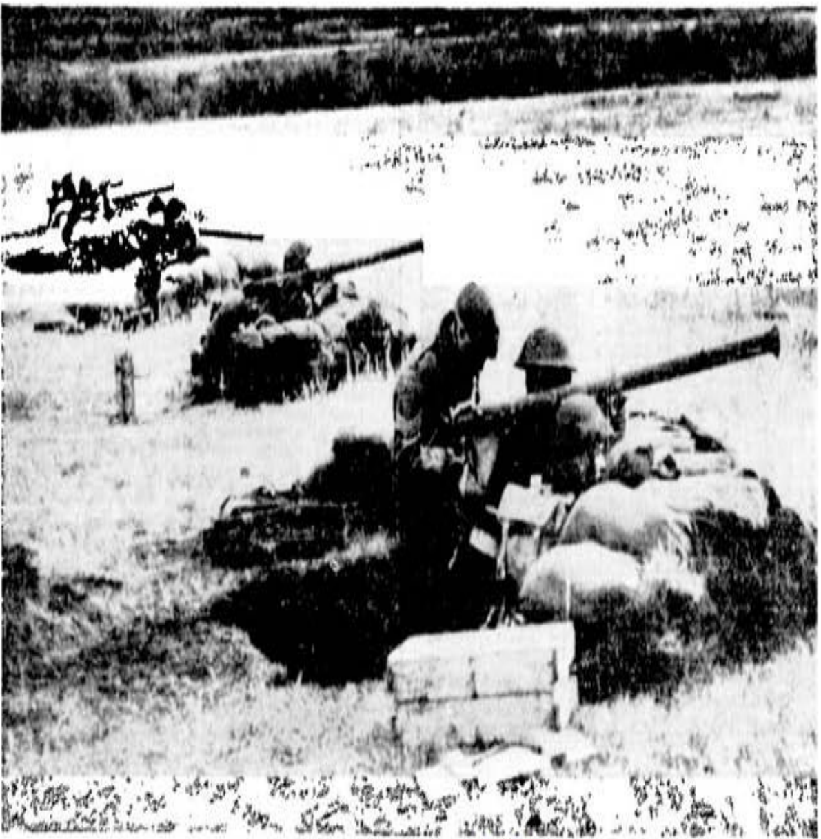
FIVE OF 10 BAZOOKA TEAMS engaged in firing practice at Sarcee military camp are shown above as they crouched in their weapon pits waiting the order to fire. The 2.36-inch rocket launcher shown here was used with great effect during the Second Great War. Although considerably smaller than the 3.5-incher to be used by the special force troops later, the principle for training purposes is the same. Gas masks are worn by the troops during practice purely as a precautionary measure.