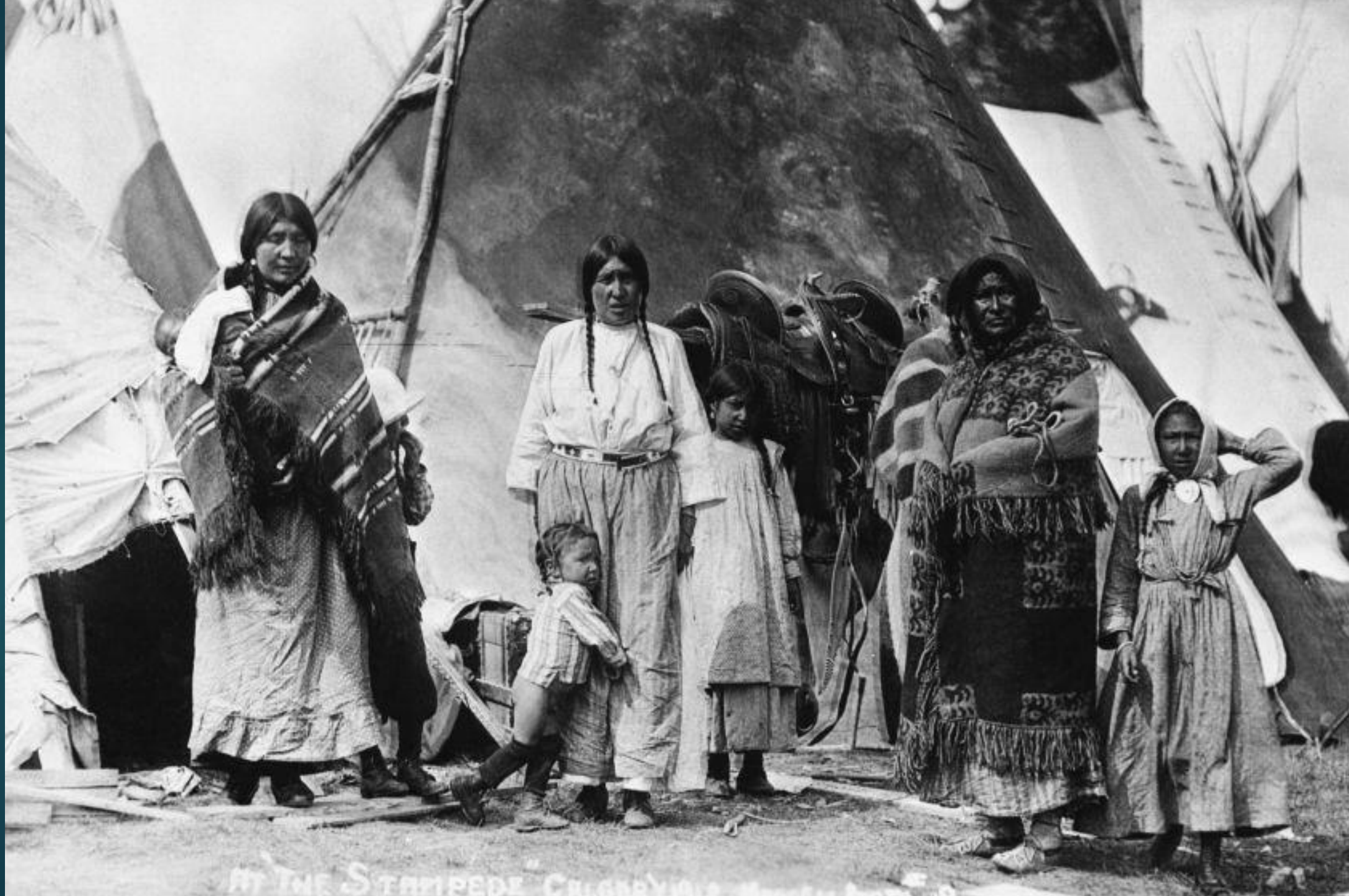
AT THE STRIPED CALGARY MOUNTAIN