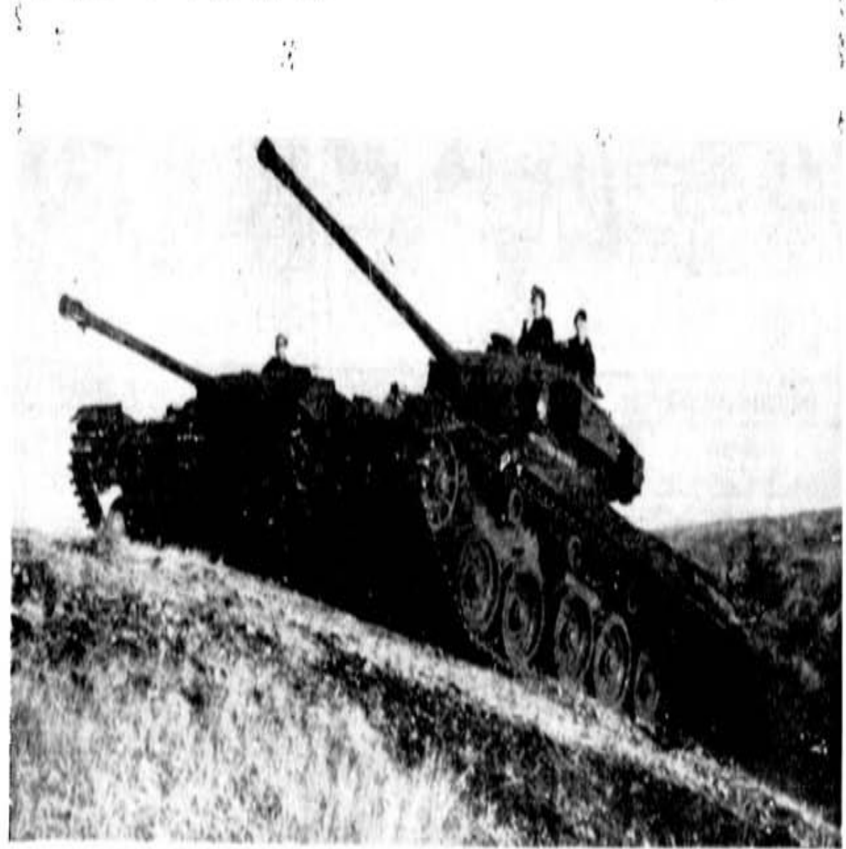
THE FIRST OF THE "PUSHBUTTON" TANKS , the Centurion, Mark III, is shown above as two of the models now on issue to Lord Strathcona's Horse (R.C.), traveled through some rough terrain at Sarcee military camp Tuesday afternoon. The Strathcona's are now in the process of converting from the use of the obsolescent U.S. Sherman to the new Centurion. A gunnery school in the use of the new 20-pounder gun, which will fire while the tank is on the move, is being conducted at Currie Barracks while a driving and maintenance course operates at Sarcee.