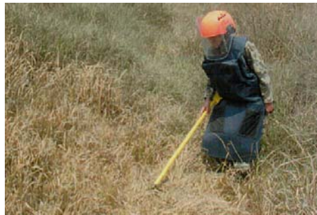
The Schonstedt GA-52Cx at work in Nepal

In early October, Schonstedt Instrument Company responded to an immediate need on the part of the United Nations for (5) GA-72Cd demining instruments for Gaza. The shipment brings to over 300 the number of Schonstedt locators sent to UN-supported humanitarian demining teams in 19 countries – countries that would not otherwise have access to demining capabilities. The units are donated by Schonstedt and its customers, as well as other groups, associations and individuals, as part of the company's ongoing Humanitarian Demining Initiative. Visit www.findUXO.com for further information.