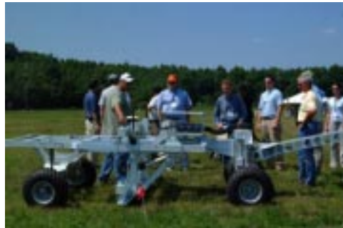
Photos from NAOOC meeting in Aberdeen, MD - July 2005

Feedback on the meeting has been extremely positive, from all parties. Members of the press attended the field demonstration. An article was published in the Baltimore Sun on Friday, July 29 th (see NAOOC website), and a film clip was developed to be aired on Soldiers Radio and Television (see NAOOC website). Follow-up meetings are being held with SERDP/ESTCP management to compare notes and exchange feedback comments and discuss potential subsequent collaborative efforts.