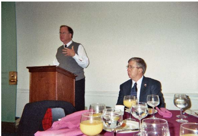
Representative Sam Farr (CA) presenting at the NAOC Lobby Day 2006